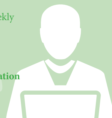
Association Statement of Operations 2014-2016

Cerebral Palsy (CP): Host site for weekly ComputAbilities program.